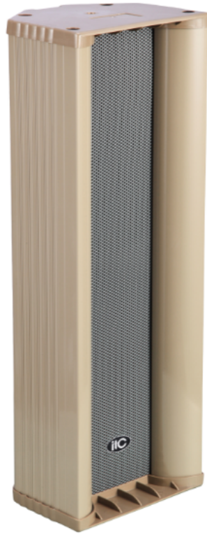
Material: Aluminum alloy