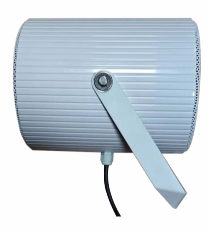
Material: Aluminum shell and aluminum mesh