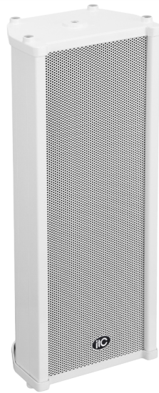
Aluminum and ABS plastic