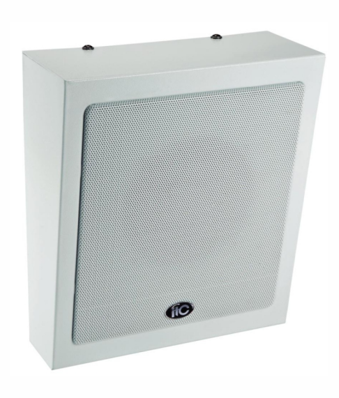
Material: iron shell + iron mesh cover