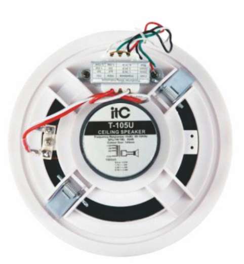
Material: Iron mesh cover