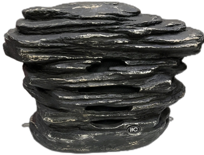
Material: organic resin